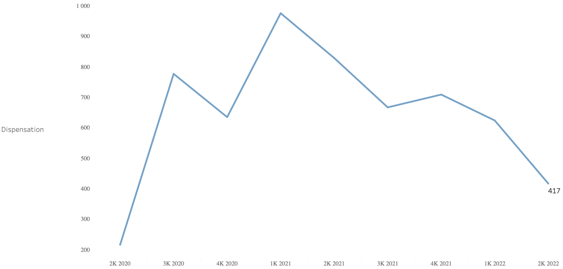
No of Transactions by Quarter